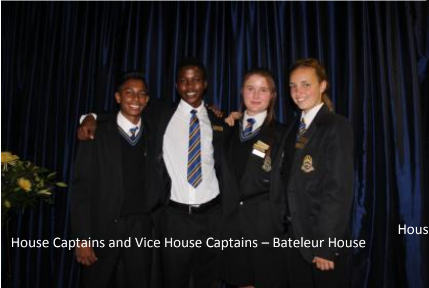
House Captains and Vice House Captains – Bateleur House