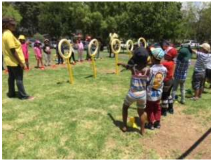
Silver Dolphins in action at Buzzi Bodies