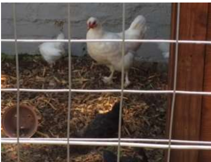
Henny Penny and her chicks in the living classroom.